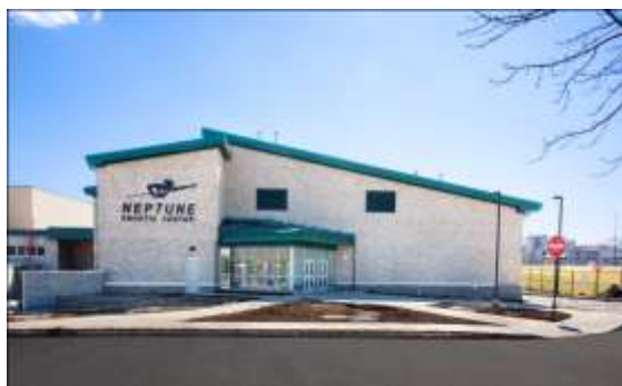
Neptune Aquatic Center Front

The Aquatic Center is attached to the back of Neptune High School. The address for Neptune High School is 55 Neptune Blvd, however, to access the facility – you must turn onto Heck Avenue. On the left hand side, you will see the glass entrance to the facility with a separate entrance. See below parking information.